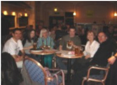
The calm before the storm!

And May all runners Leap the boundary of imaginary Separation